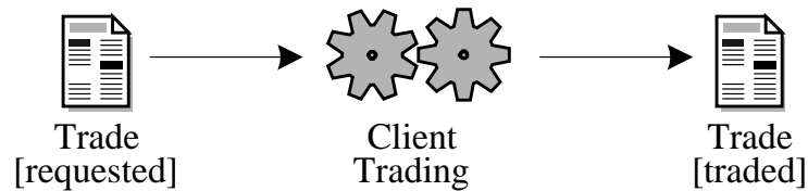
Figure 2. Example of special icons for entities and actions

Tools and users are free to add additional icons to represent more specific concepts. Examples of such icons include icons for documents and actions, as shown in Figure 2.